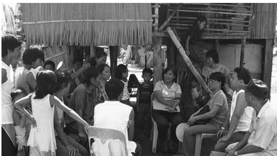
A focus group discussion in Barangay Lasip Chico