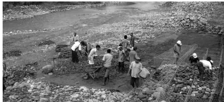
Construction of gabions to prevent inundations in San Martin Alao

(In partnership with ITDG - Soluciones Practicas)