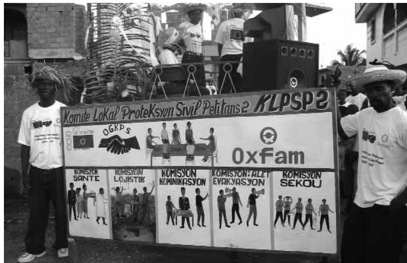
A panel created by the Local Civil Protection Committees in September 2004