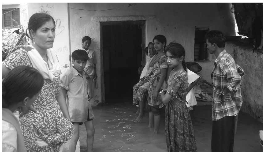
A household affected by the 2006 Gujarat floods and reimbursed by the insurance scheme

The poor amongst disaster victims are repeatedly exposed to and affected and impoverished by disasters. They are also perpetually restricted in their access to vital financial services such as micro-insurance, which has recently made progress in reducing disaster risk among the poor. As spreading further such micro-insurance products requires continued innovations, the Afat Vimo was developed bearing in mind local conditions and contexts.