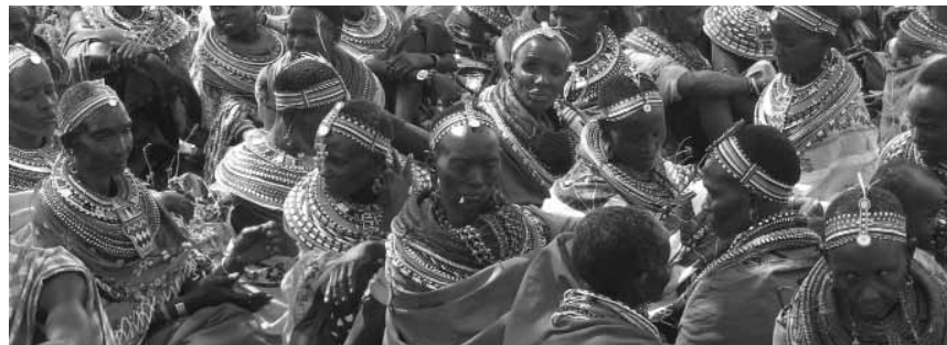
A local community participating in the project

(In partnership with CODES, PISP and CIFA)