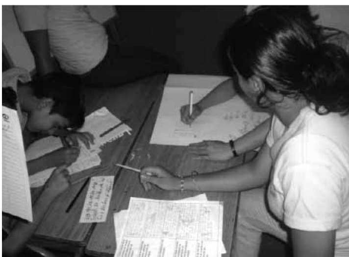
School children prepare disaster management and risk reduction plans

With children representing more than a third of disaster victims, the humanitarian sector can no longer restrict children's role in disasters to that of passive victims. Providing children the opportunity to be directly involved in DRR activities enables them to develop skills to be prepared for any threat. Furthermore, the emphasis on rights-based approaches to humanitarian work brings forward the right of children and youth to be protected from hazards and vulnerabilities through their participation in decision making and efforts to address disaster management and risk reduction. This is in line with the international legal framework set under the UN Convention of the Rights of the Child, which upholds children's rights to protection (Article 6) as well as participation (Articles 12, 13).