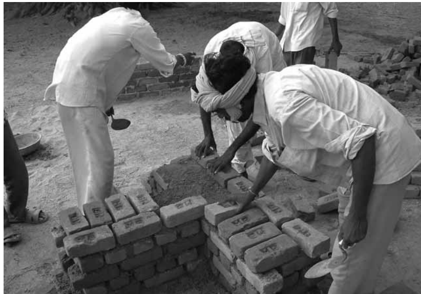
Masons certification programme in Datrana village, Patan District of Gujarat

Toward a Disaster-Resilient Built Environment: Creating a Culture of Safe Buildings Sustainable Environment and Ecological Development Society (SEEDS)