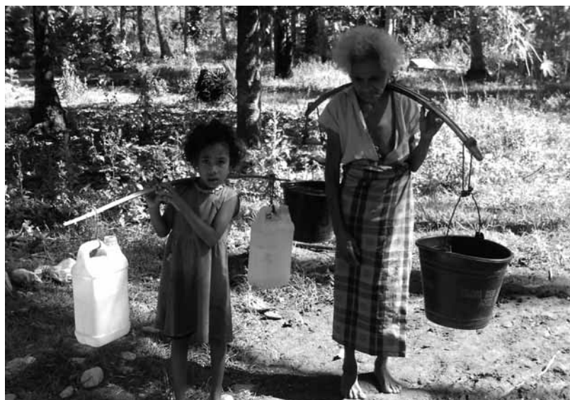
In the Oeniko village, mother and daughter have to walk five km to get drinking water

PMPB - Community Association for Disaster Management (In partnership with Yayasan Pikul)