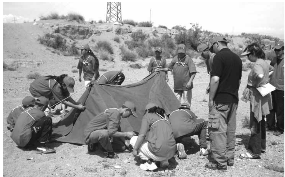
Training of "school disaster teams" on preparedness and first aid

Mobilising Rural Communities for Disaster Preparedness in the Kyrgyz Republic Christian Aid (In partnership with Shoola)