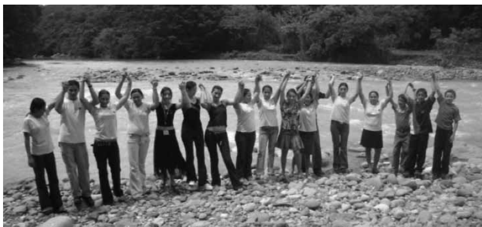
Children participating in Plan International's DRR activities