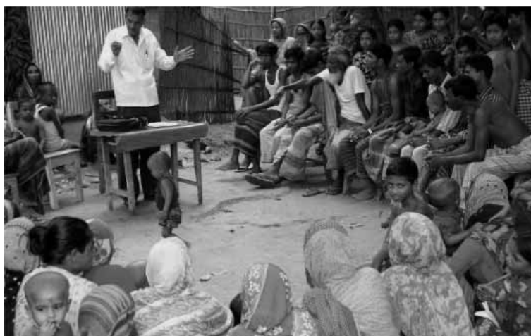
An informal meeting with community members