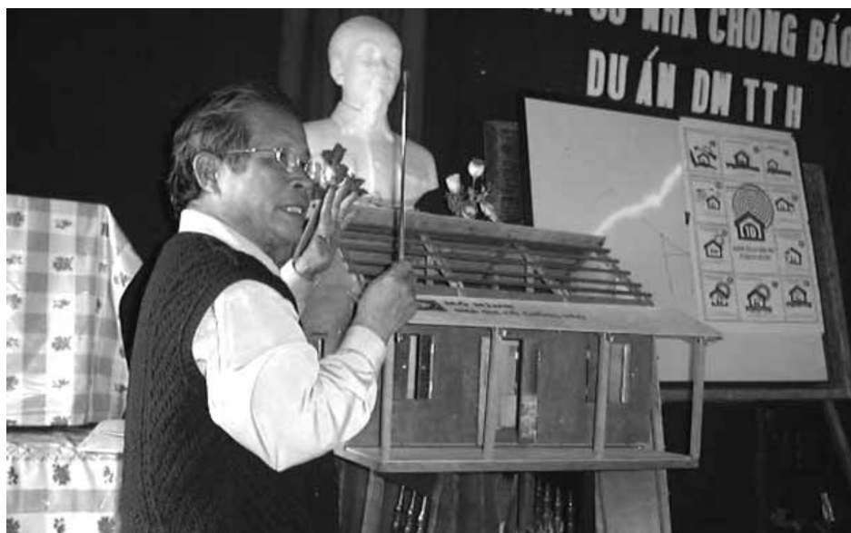
Training builders on key safety points