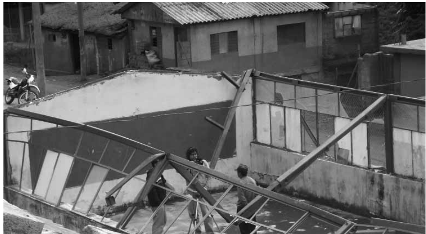
A school roof collapsed under the weight of volcanic ash

The Critical Video Analysis was prompted by the realization that best practices and lessons learned from the DIPECHO III Risk Mitigation Project, as well as the challenges faced during its implementation, had to be gathered and analyzed in an innovative way to enable donors, partners and project promoters/implementers to advance similar work in the fields of emergency and risk mitigation.