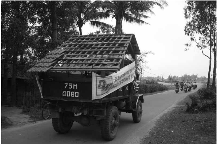
A model house travels to the communes to show safe construction techniques

The initiative has been launched because Vietnam's disaster risk reduction strategy pays insufficient attention to the capacity of families and local communities to play a key role, suggesting that top-down approaches should mesh with community-based disaster risk reduction potential. The other reason for launching the initiative is to reduce the general impact of loss of housing caused by typhoons and floods.