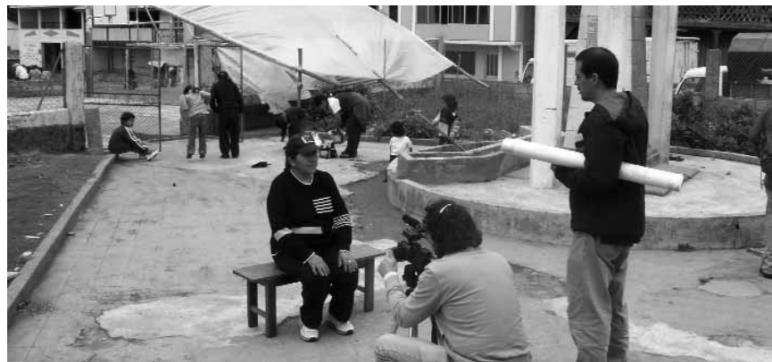
An interview in the community of Bilbao

"Critical Video Analysis" of Project Entitled "Communities Affected by Tungurahua: Mitigating the Risks of Living Near an Active Volcano" Catholic Relief Services (CRS)