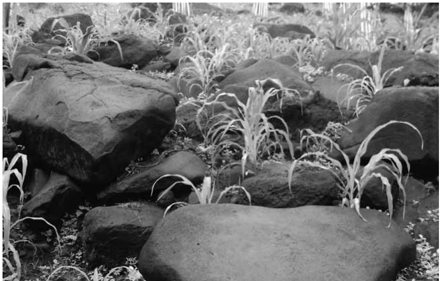
Maize planted between rocks in the community of Pulau Pura