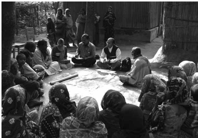
Participatory development of an action plan

The project aims to demonstrate that increasing the resilience of poor communities' livelihoods reduces vulnerability to disaster risk while contributing to poverty reduction. Evidence of the impact of this approach is used to influence local government officials and policy makers to be more responsive to the needs of the poor.