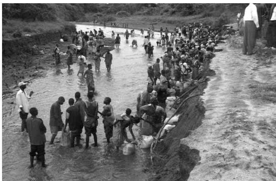
Villagers from Pende village reinforce dyke with sand bags

"Together, We Can Make a Difference": Benefits of Multi-Stakeholder Flood Management Tearfund (In partnership with Eagles)