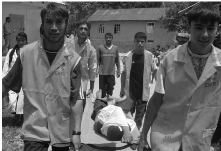
A disaster simulation exercise at the community level

The "Disaster Preparedness Action Plan Tajikistan" Project CARE International