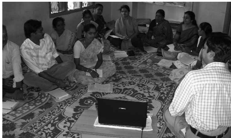
AIDMI presents the Afat Vimo insurance scheme in a tsunami-affected area

All India Disaster Mitigation Institute (AIDMI)