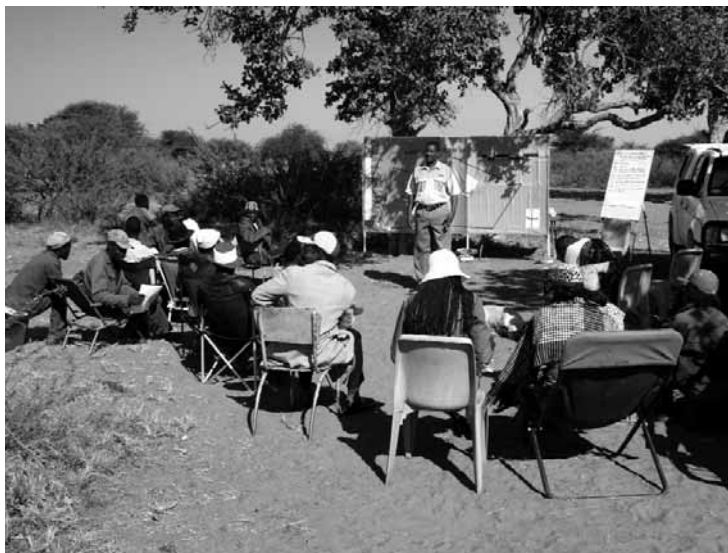
FIRM meeting near Okakarare, where LLM results were presented and discussed

The major goals and objectives were to understand drought and desertification in the Namibian context, to develop awareness and capacity to deal with their various forms, particularly amongst communal farmers and their service providers, and to contribute to relevant policy formulation.